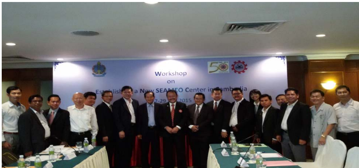
(The participants of the Workshop: High Officials and representatives of MOEYS, Cambodia, SEAMES and SEAMOLEC)

SEAMES is to provide further inputs on the draft documents on establishing a new Centre in Cambodia (SEAMEO TVE) to ensure that MOEYS Cambodia can submit the required working paper to the 38 th HOM. SEAMES and SEAMOLEC are to identify schools in Cambodia that can participate in the school networking programme.