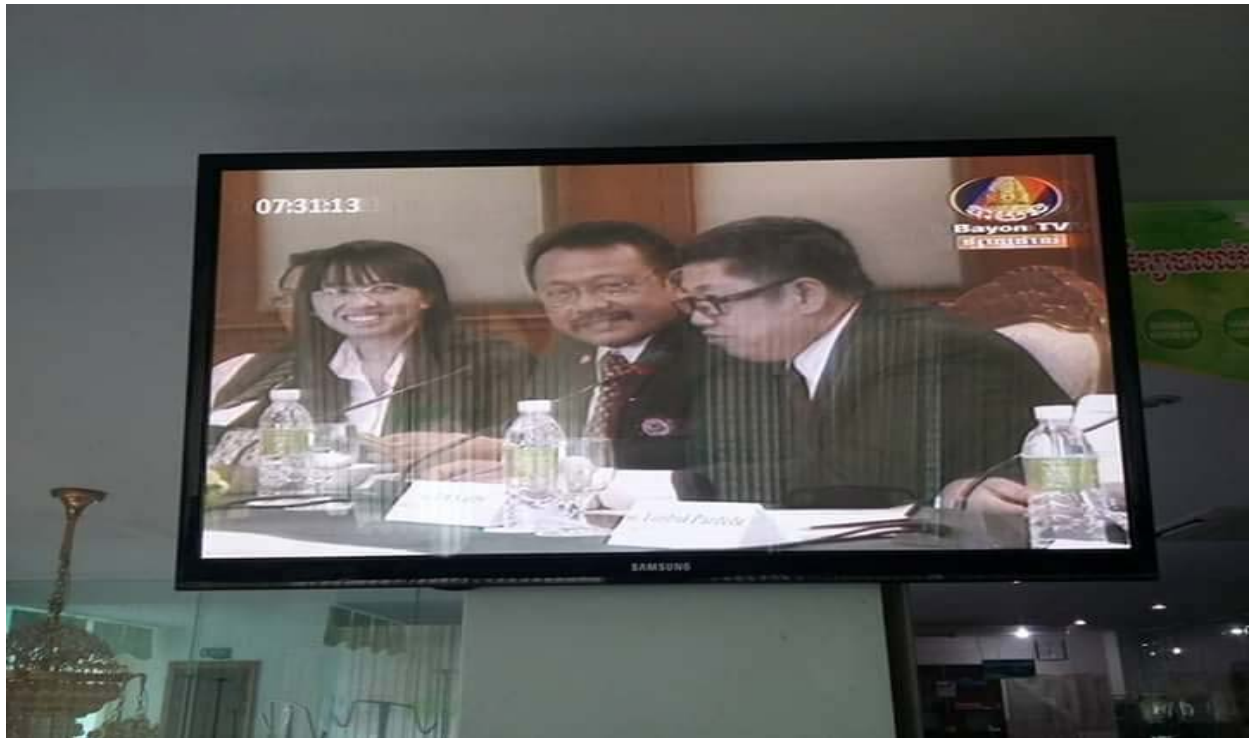
(Activities in the workshop were shown in TV Bayon Cambodia)