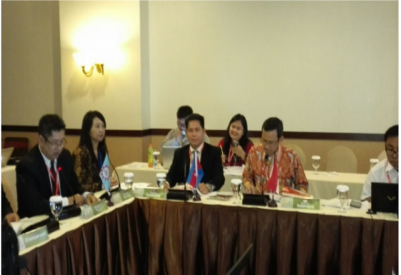
(The Deputy Director of SEAMOLEC presenting the SEAMOLEC Annual Report for FY2014/2015 at the meeting)