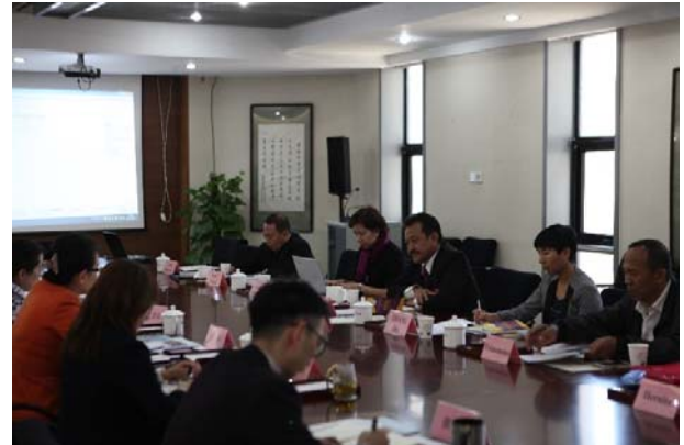
Visit to CEAIE