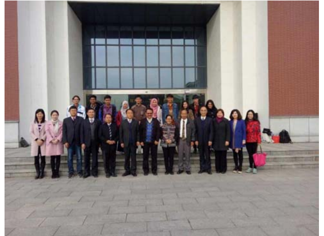
Visit to NRIT