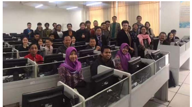
Visit to WXIT