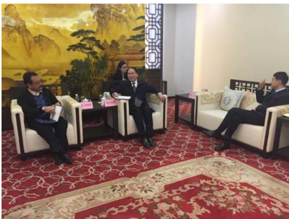
Visit to JPDE