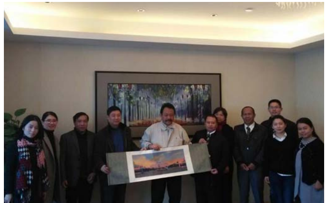
Meeting with ZFIT