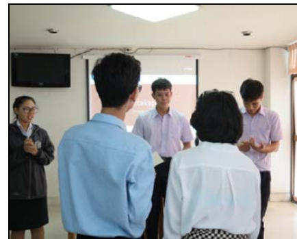
The morning session